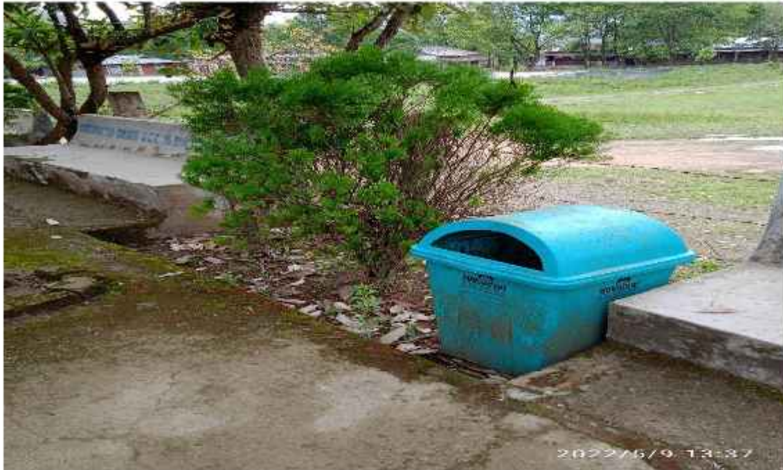
Pic 1: Dustbin in front of the Administrative block