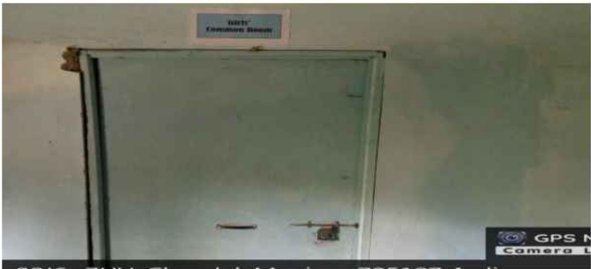
Pic: Girls' Common Room