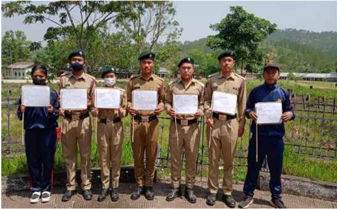
Pic 3: Van Mahotsav Celebration(5 th July 2021)