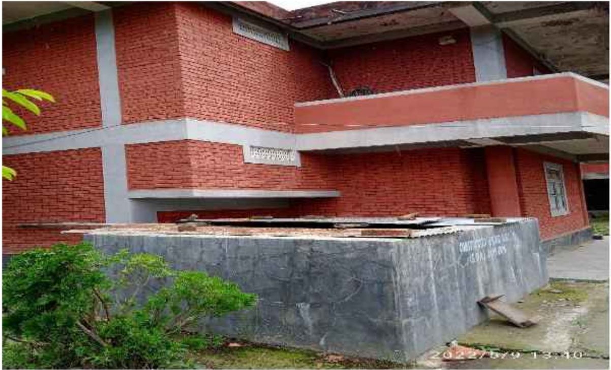
Pic: Water harvesting Tank