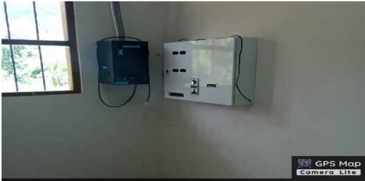
Pic: Sanitary Napkin tillering Machine