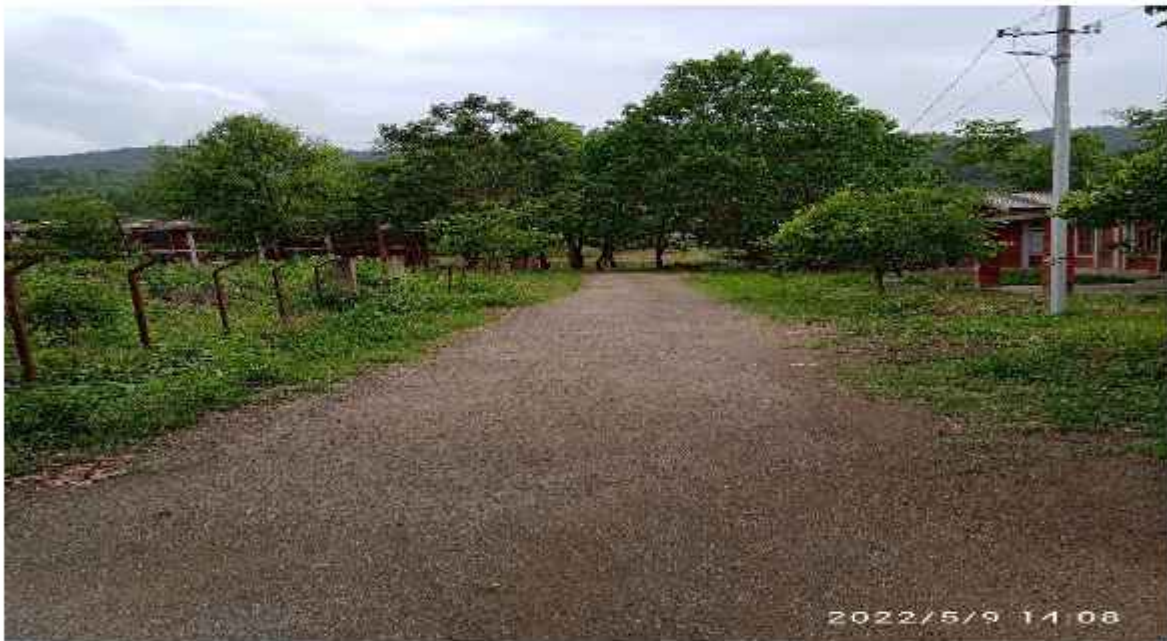
Pic: Pedestrians friendly path